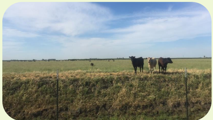
Existing grazing lands may be eligible for the EcoPlan.