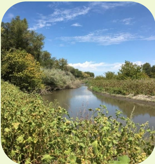
Lands with existing riparian habitat may be eligible to participate in the EcoPlan.