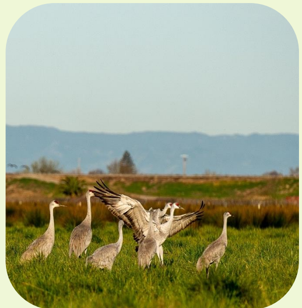
Agricultural fields with grain crops, alfalfa, and pasture may be eligible to support Sandhill cranes.