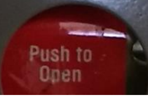
Figure 1 - Eaton 1200A