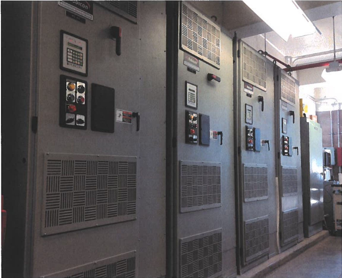
Figure 1 - N52