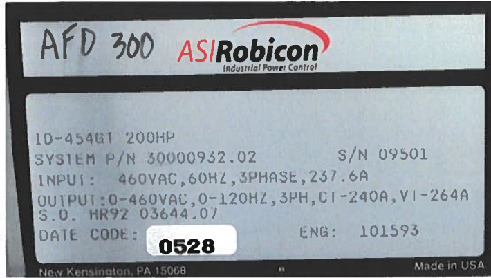
Figure 2 – N52 AFD 300