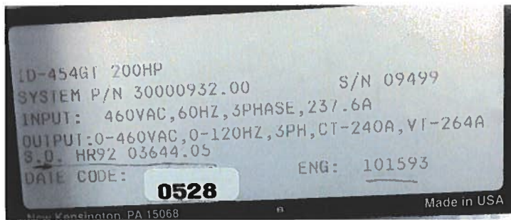
Figure 4 – N52 AFD 100